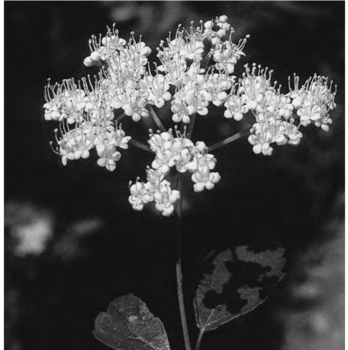
Viburnum Dentatum Flower.

also drought tolerant, once established. There are several garden-worthy cultivars to choose from including Blue Muffin, Chicago Lustre and Northern Burgundy.