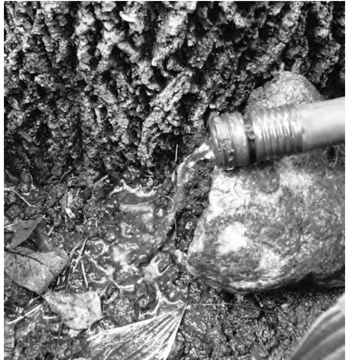
Trickle a pencil-thin stream of water at the base of trees and shrubs for several hours.

The most important thing you can do is water the trees and shrubs throughout fall and into early winter until the ground freezes. Allow the hose to trickle a pencil-thin stream of water at the base of trees and shrubs for several hours. Do not fertilize trees and shrubs until late winter or early spring.