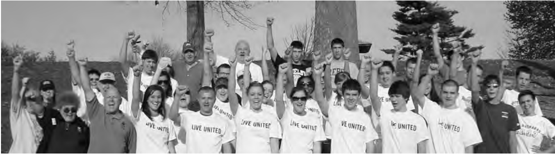
Volunteers cheer the success at the 2009 Great Garfield Cleanup on April 25.