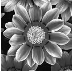
Gazania Daybreak Pink

One that may be less familiar is Daybreak Pink Gazania , a ground-hugging, sun-loving annual with 3-inch wide