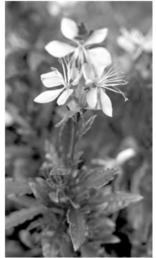
Karalee Petite Pink Gaura

Other plants in the Sunken Garden: 'Whiskey' and 'Brandy' Begonia ; Mexican feather grass ( Stipa tenuissima ); 'Titan Blush' vinca ( Catharanthus rosea ); 'Sizzler Pink' salvia ( Salvia splendens ); rose Canna ; Easy Wave White Petunia ; Domino Salmon Pink flowering tobacco ( Nicotiana ), and 'Angel Mist' Angelonia .