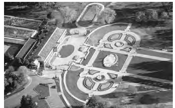
Aerial view of the Sunken Garden area with the Conservatory on the left.

Proceeds from this event will go to the Friends of Garfield Park as they continue in their mission to ensure the preservation and continuation of the public benefits of Garfield Park.