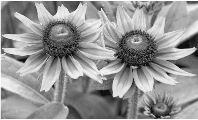
Cherry Brandy ( Rudbeckia hirta )

'Cherry Brandy' ( Rudbeckia hirta ) has red flowers, but not the fall-ish hue you might think. This 4-inch wide flower is cherry red, making it a perfect plant for the summer garden and for a cut flower. Sometimes called gloriosa daisy, the plant gets about 2 feet tall.