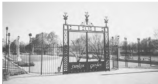
North gate into the Sunken Gardens

Early registration $20, $15 for student, and guarantees an event t-shirt. Registration will be taken the morning of the event and will cost $30 with t-shirts as remaining supplies last.