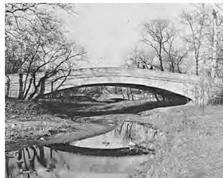
Pleasant Run bridges, Garfield Park