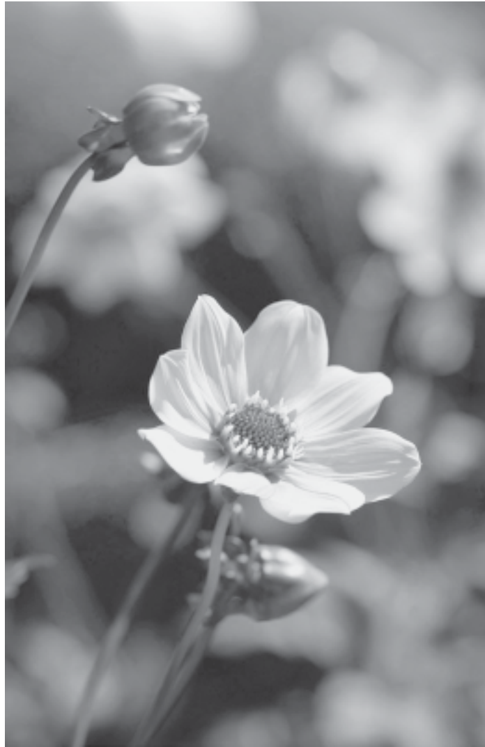
Dahlia Happy Single Date Bulb

Frost has probably blackened or turned to mush the tops of tender bulbs, including dahlias, tuberous begonias, cannas, caladiums, pineapple lily and gladiolas. We can winter over these plants — or not.