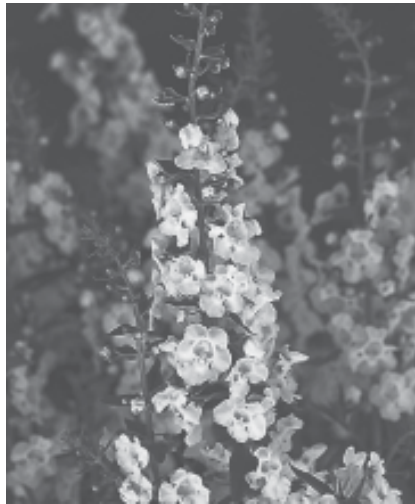
Angelic annual grows in the Sunken Garden

times a month. Always read and follow the label directions of the product you select.