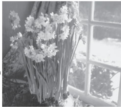
Paperwhites bring spring and fragrance indoors

several bulbs and plant them a few weeks apart to have a succession of flowers over a long period. Store bulbs in a cool, dry place where they won't freeze or get too warm to sprout. Keep them away from fruit because ethylene gas can damage the flower inside the bulbs.