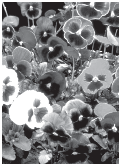
Classic beauty: 'Majestic Giants Mix' pansy has very large flowers on short plants.

• 'Ideal Violet' ( Dianthus ) brought improved heat tolerance to a garden favorite when introduced in 1992. A cross between China pink and sweet William dianthus, this annual is quite cold tolerant, making it a colorful addition to the early spring or fall garden.